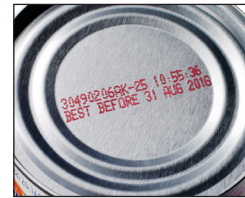
CIJ on metal can

Videojet designs and tests its CIJ fluids in our fluid development center in North America. Ink formulations are manufactured in Videojet facilities in different regions of the world to ensure convenient supply chain availability to our customers. Ink production is managed in GMP compliant facilities to help ensure consistent production, batch after batch.