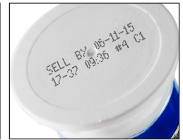
CIJ on plastic cap